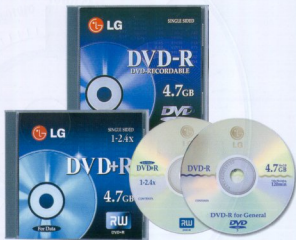
DVD - R / + R